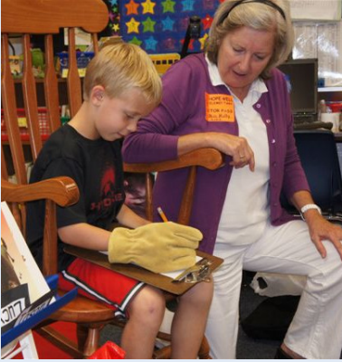
A Shawnee Run student participates in “Understanding Down Syndrome”